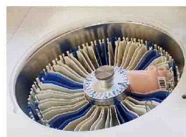
Reagent Tray 2~8°C cooling for 24 hours.