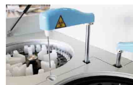
Sample Needle Liquid level sensor function. Anti-collision function. Reagent volume real-time detection.