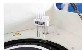
Washing Probe Independent 4-step washing system.