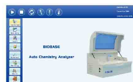
Software User-friendly software.