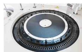
Reaction Tray 37±0.2°C, real-time monitor.