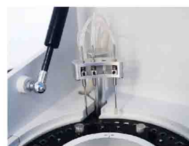
Washing Probe Independent 2-step washing system.