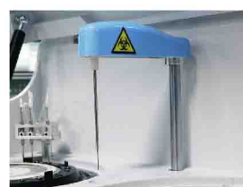
Sample Needle Liquid level sensor function. Anti-collision function. Reagent volume real-time detection.