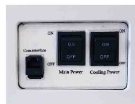
LAN Port Access