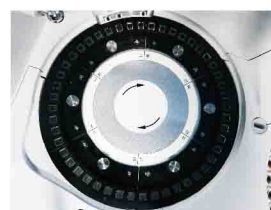
Reaction Tray 37±0.2°C, real-time monitor.